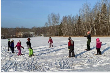
Enjoying our Canadian Winter