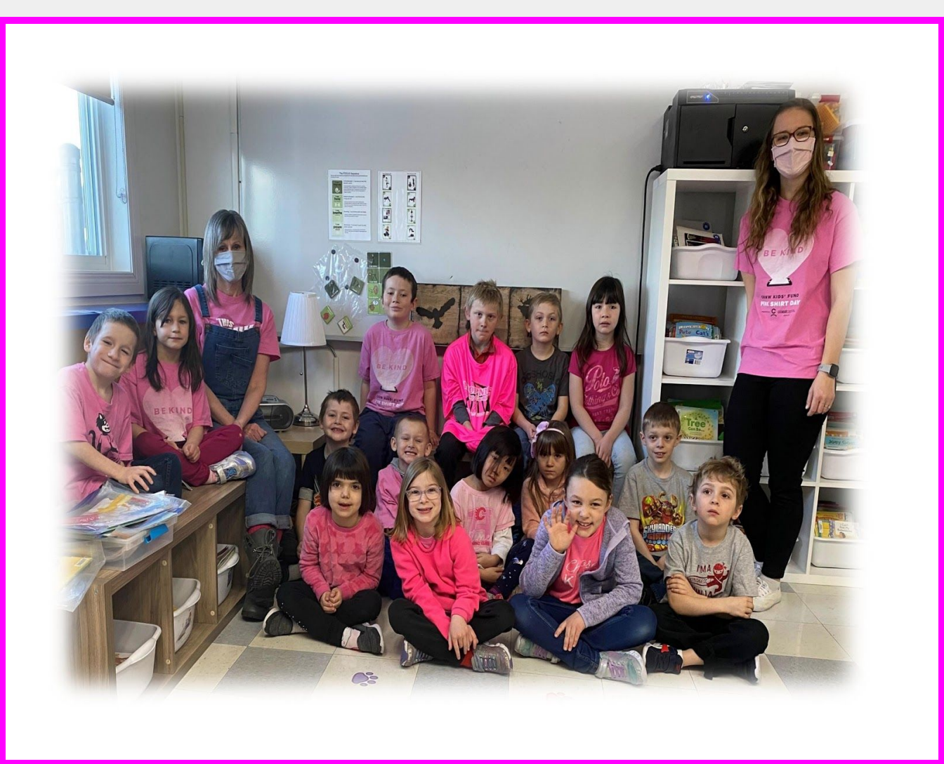
PINK SHIRT DAY Grade 1 and 2' being KINDNESS NINJA's

We look forward to celebrating your child's achievements in school so far this school year.