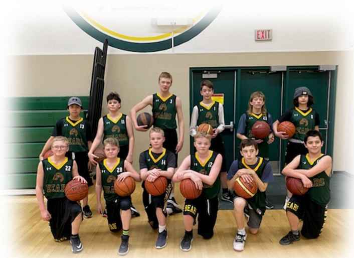
CTF Boys Basketball Team