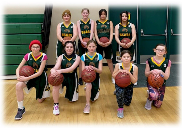
CTF Girls Basketball Team