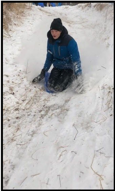
Sliding into Spring