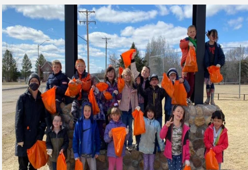
Community Clean Up Earth Day 2021

Tara McQueen or Megan Petreshen or call the school and we'll forward your name and number to one of these ladies.