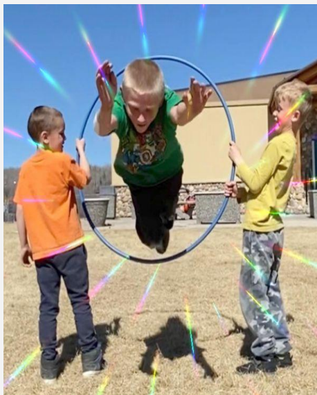
Jumping thru hoops looking for Spring