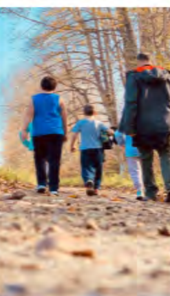
Terry Fox Run