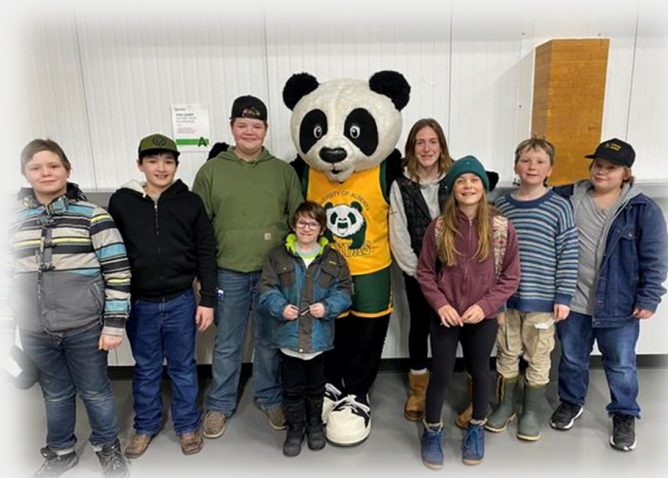
Field Trip to Golden Bears Basketball

Lorna Hiemstra Principal lorna.hiemstra@pembinahills.ca (780) 584-3751