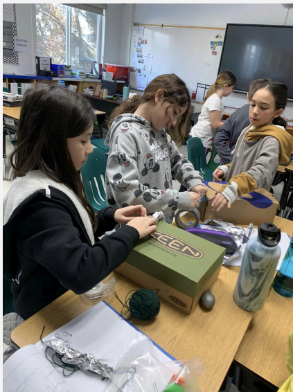
Gr 4 and 5 Lunch Box Alarms