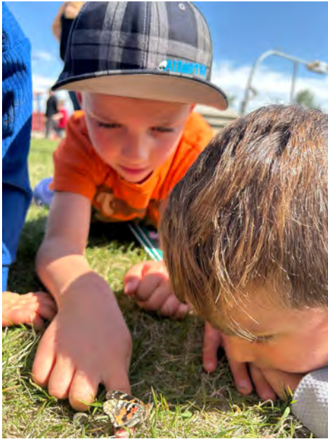
Outdoor Learning - Releasing our Painted Lady Butterflies