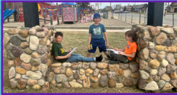
Taking ART Class Outside